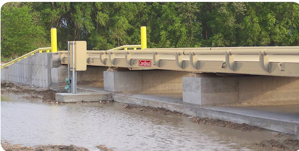
The Guardian truck scale can operate fully submerged underwater. This Guardian installation pictured here functions as a low-water bridge in addition to being a truck scale.