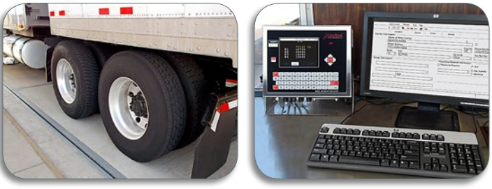
Cardinal Scale reserves the right to improve, enhance or modify features and specifications without prior notice. All registered trademarks are the property of their respective owners.

Cardinal's complete line of proven single and multiple platform static vehicle scales complete the weight enforcement package. Available in either low profile or pit installations with your choice of analog strain gauge, hydraulic, or digital load cell monitoring systems, these highcapacity heavy-duty scales provide the ultimate in performance and durability.